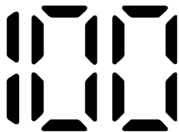
Water temperature display