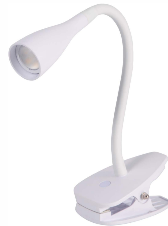
Instruction Manual MODEL:L008C